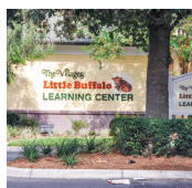
The Villages Little Buffalo Learning Center (Ages 1 – 2)

We're proud to offer the families of our staff access to award-winning Charter Schools for their children of all ages.