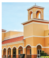
The Villages Charter Middle School (Grades 6 – 8) Earned 17 straight A's (2003 – 2019)