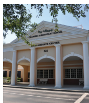
The Villages Charter Elementary School (Grades K – 5) Earned 17 straight A's (2003 – 2019)