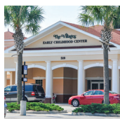
The Villages Early Childhood Center - Pre-K (Ages 3 – 4)