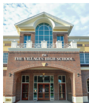
The Villages High School (Grades 9 – 12) Earned 14 straight A's (2006 – 2019) One of only 25 high schools in Florida to earn 13 straight A's.

*Employment eligibility does not guarantee placement. There are various factors that must be taken into consideration, such as available enrollment slots, the new student's past disciplinary history, prior year attendance and any special accommodations that may be needed. For more information about enrollment, please visit www.TVCS.org .